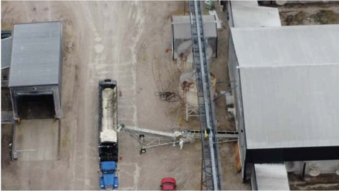
Hens culled using ventilation shutdown plus are moved down a conveyor belt into a truck, after which they'll be disposed of. This took place on an egg factory farm of more than 5 million hens in Iowa in 2022.

In a mass killing of 5 million birds in March 2022 at Rembrandt Foods, some employees reported that it took about a month to pull the dead poultry from the cages and dump them into carts before piling the birds into nearby fields and buried in huge pits.